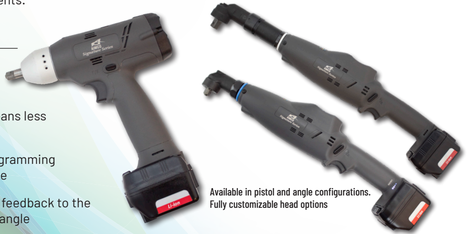
Available in pistol and angle configurations. Fully customizable head options