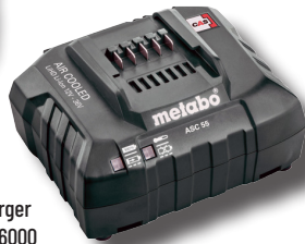
Battery Charger 120V: 627046000 220V: 627044000