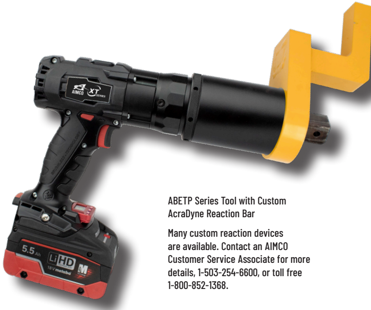
ABETP Series Tool with Custom AcraDyne Reaction Bar

Many custom reaction devices are available. Contact an AIMCO Customer Service Associate for more details, 1-503-254-6600, or toll free 1-800-852-1368.