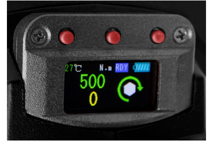
Digital Display and Control Interface

Many custom reaction devices are available. Contact an AIMCO Customer Service Associate for more details, 1-503-254-6600, or toll free 1-800-852-1368.