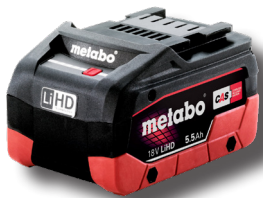
18V Li-Ion Battery 625368000

Add "-KIT" to the end of the model number to order a tool kit, which includes 1 tool, 2 batteries, and 1 battery charger. The part number must also specify "120V" or "220V" depending on power requirements.