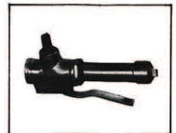
Valve Body Assembly Code 120-003-1 Components (#7, 8, 9, 10, 11, 12, 13, 14, 16, 18, 42, 50-1, 57, 58, 60, 63, 65, 72)