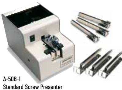
A-50B-1 Standard Screw Presenter