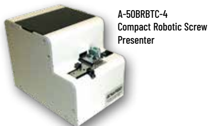
A-50BRBTC-4 Compact Robotic Screw Presenter