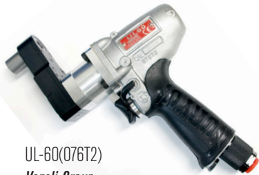
UL-60(076T2) Vazeli Group