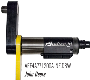
AEF4A771200A-NE.DBW John Deere