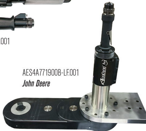
AES4A771900B-LF.001 John Deere