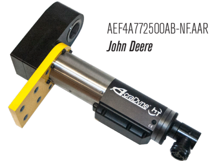
AEF4A772500AB-NF.AAR John Deere