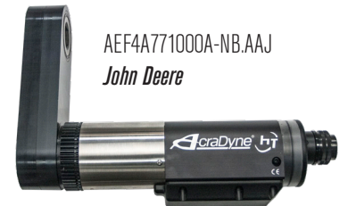
AEF4A771000A-NB.AAJ John Deere