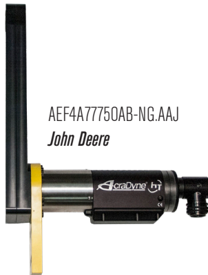
AEF4A77750AB-NG.AAJ John Deere