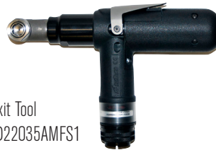
Mid-Exit Tool AEN4D22035AMFS1 Honda