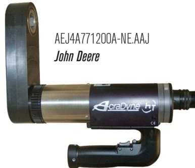
AEJ4A771200A-NE.AAJ John Deere