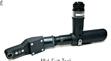
Mid-Exit Tool AEG4A22030BM-KBQQ Honda