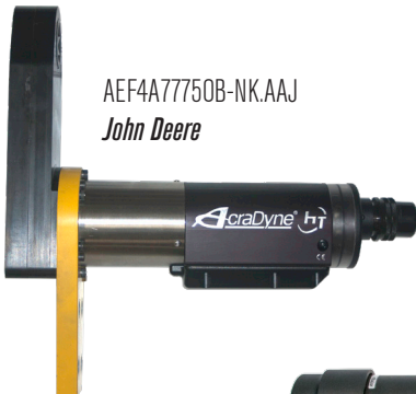
AEF4A77750B-NK.AAJ John Deere