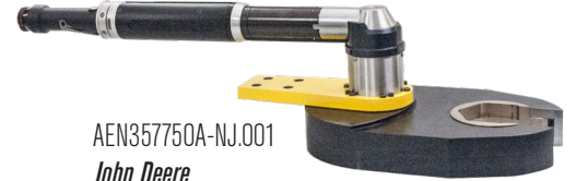
AEN357750A-NJ.001 John Deere