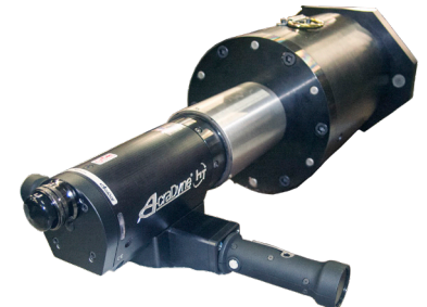
Hold & Drive AEF4A898100BDL Safran Aircraft engine assembly