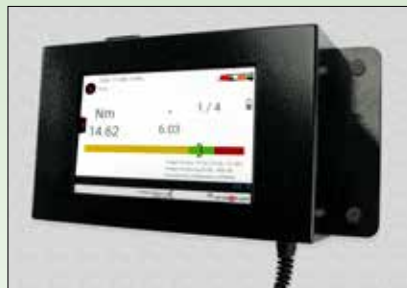
CPSKR81 Bench-Mount Controller AC Power