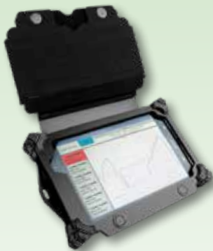
CPSKT82 Portable Controller