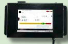
Bench-Mount Controller AC Power