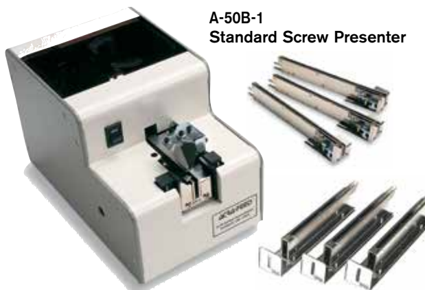
A-50B-1 Standard Screw Presenter