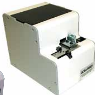
A-50BRBTC-4 Compact Robotic Screw Presenter