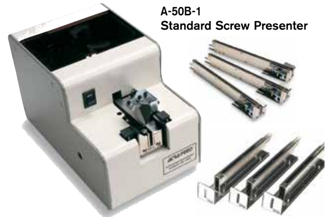
A-50B-1 Standard Screw Presenter