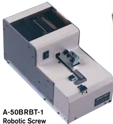
A-50BRBT-1 Robotic Screw Presenter