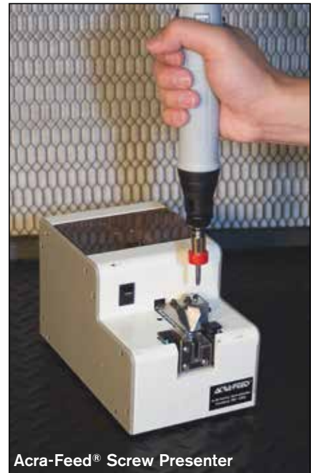
Acra-Feed® Screw Presenter