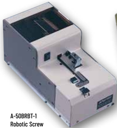
A-50BRBT-1 Robotic Screw Presenter