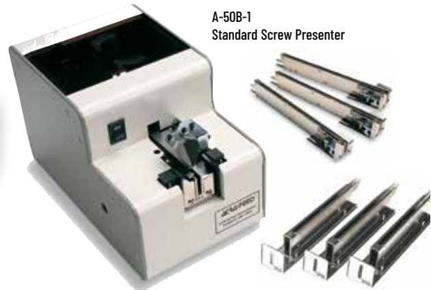
A-50B-1 Standard Screw Presenter