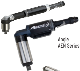
Angle AEN Series