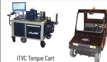
iTVC Torque Cart