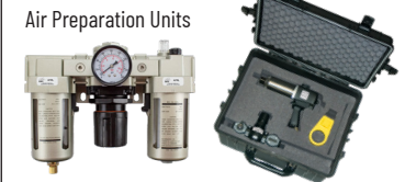
Air Preparation Units